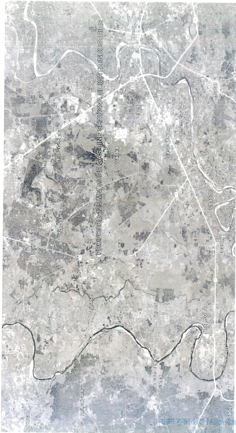
PROPOSED 125 MM DIA UNDERGROUND MDPE NATURAL GAS PIPELINE ORIGINATE FROM ONGC GGS - I NAVAGAM UPTO SHAYONA SILICATE INDUSTRIES VILLAGE RADHU DISTRICT KHEDA.